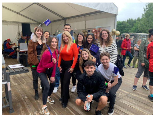
Youth mobility with Spanish participants sent by OpenEurope